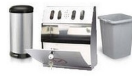
Waste And Ash Bins