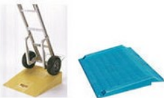
Dock Equipment And Ramps