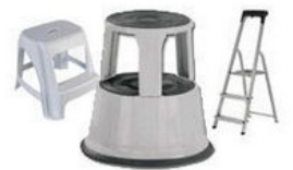
Steps And Ladders