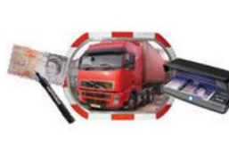
Detection And Surveillance