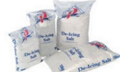
Snow And Ice Supplies