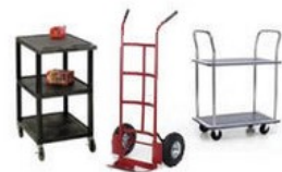
Trucks Trolleys And Ramps