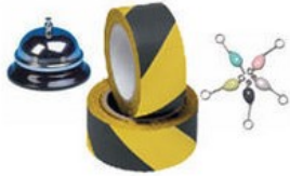
Alarms And Security