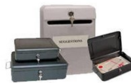
Deed And Document Boxes