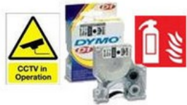
Signs And Labels