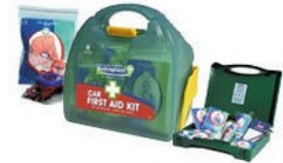
First Aid Kits