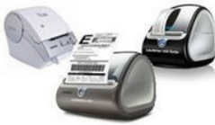
Labelling Machine Supplies