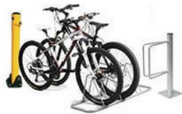
Cycle And Vehicle Security