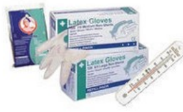
First Aid Equipment