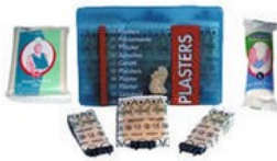
First Aid Refills