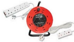
Lighting And Electrical