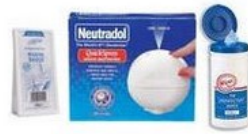
Cleaning And Janitorial