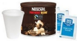
Catering Drinks And Foodstuffs