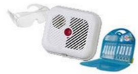
Health And Safety