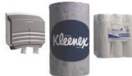
Paper Towels Tissues And Rolls