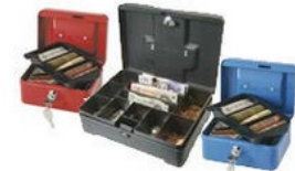
Cash Boxes And Holders