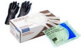
Cleaning Wear And Gloves