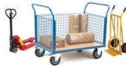
Hand Trucks And Trolleys