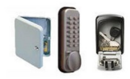
Locks And Key Security Systems