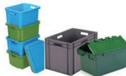
Parts And Storage Bins