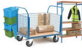
Handling And Lifting