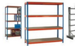
Storage Rack Systems