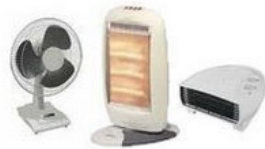
Heating And Cooling