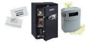
Security And ID