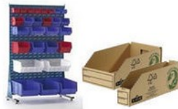
Parts And Storage Bins