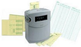
Attendance And Time Keeping