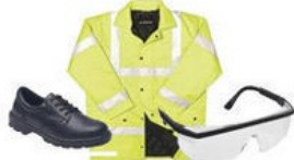
Protective Equipment And Clothing