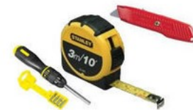
Tools And Tool Storage