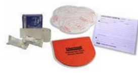
Vehicle And Fleet