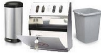
Waste And Ash Bins