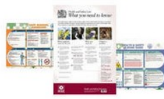
Health And Safety Posters