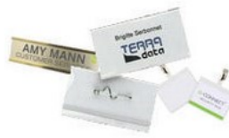
Badges And Name Holders