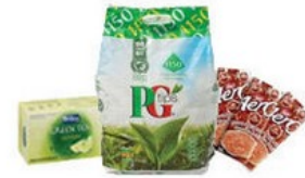
Tea And Hot Chocolate