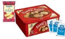
Snacks Milk And Sugar